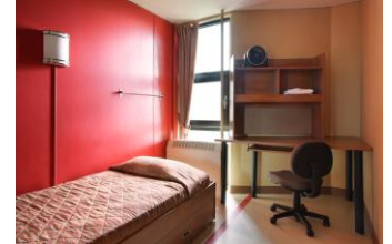
Superior Solo Room