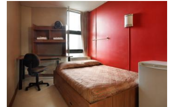
Superior Duo room